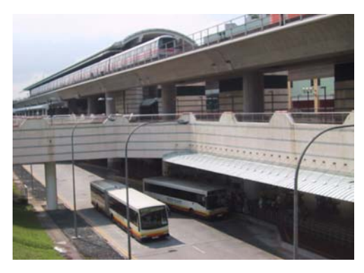
Figure 2. The Woodlands interchange