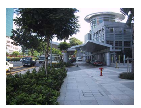
Figure 3. The Novena station

The main strategies of achieving a multimodal transit system can be summarized as the followings (Konopatzki, 2002; Segaram, 1994, Tong, 2002):